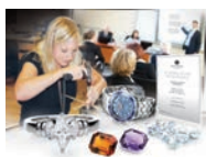
EDUCATION & TRAINING

PO BOX 151, NEWHALL STREET, BIRMINGHAM B3 1SB, UK TEL: 0871 871 6020 FAX: 0121 236 9032 EMAIL: GEM@THEASSAYOFFICE.CO.UK WWW.THEASSAYOFFICE.CO.UK